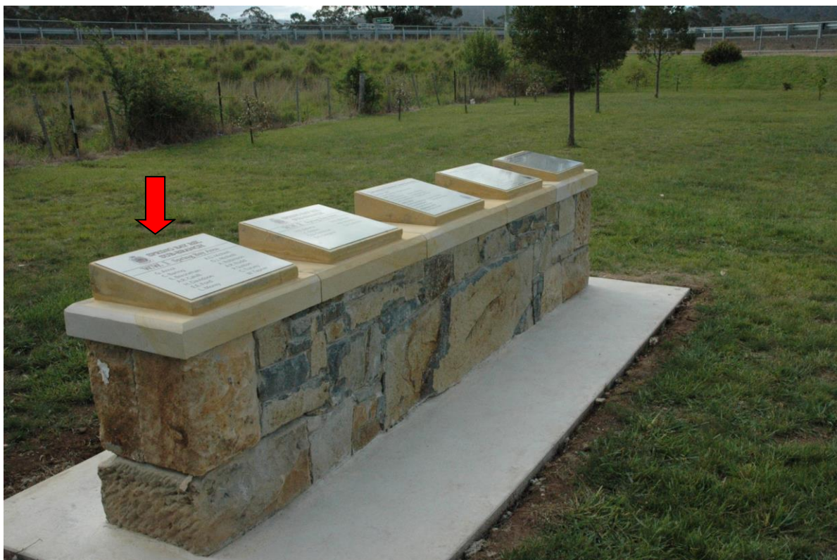
Triabunna Remembrance Plaques