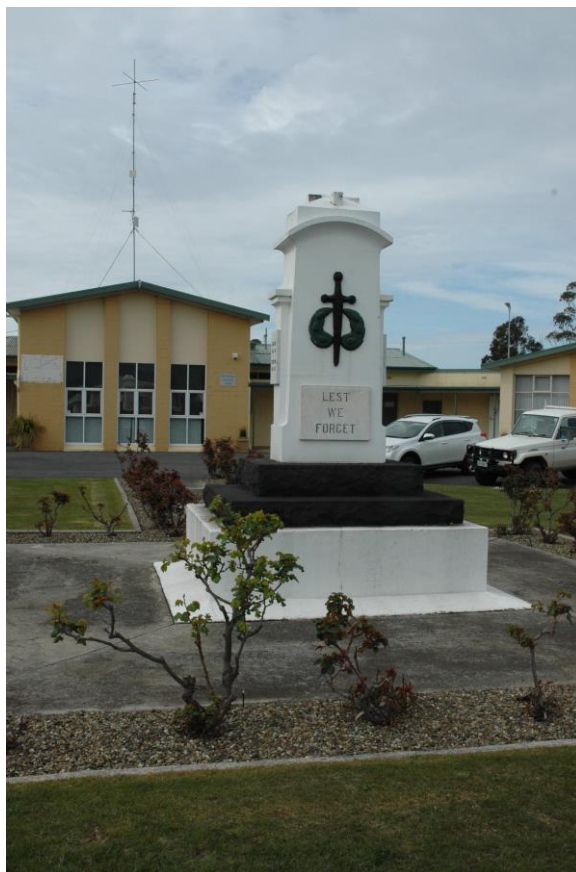
Spring Bay District War Memorial