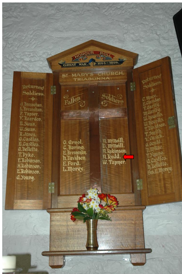
St. Mary's Church Triabunna Honour Roll